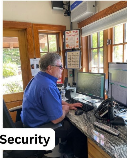
Divide Gate Security