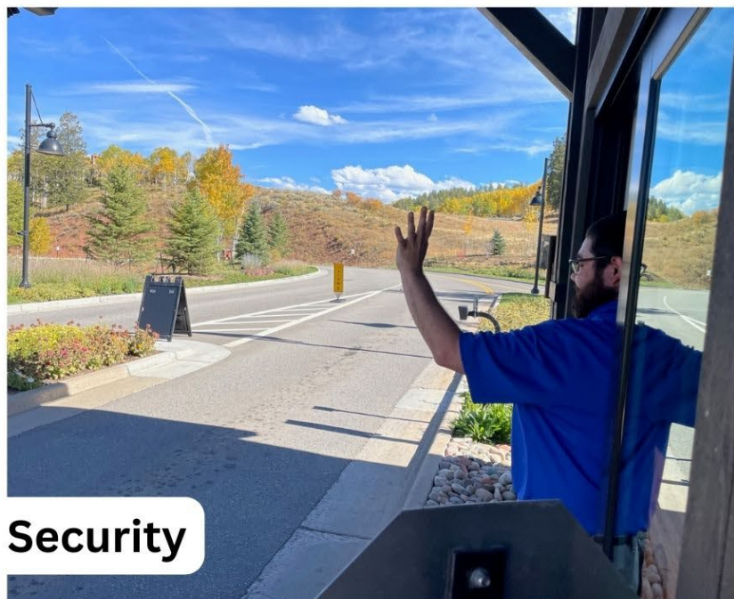
Ranch Gate Security