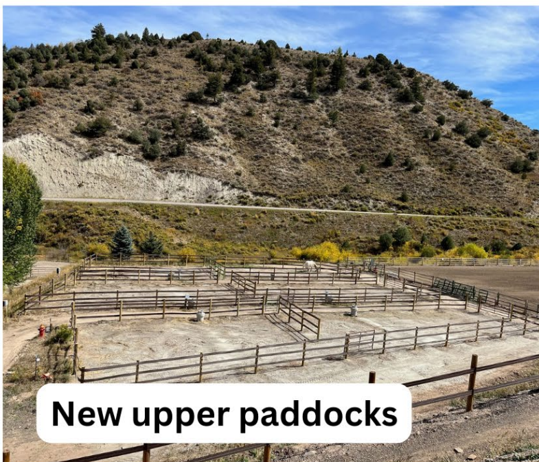
New upper paddocks