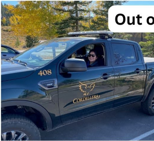
Out on Patrol