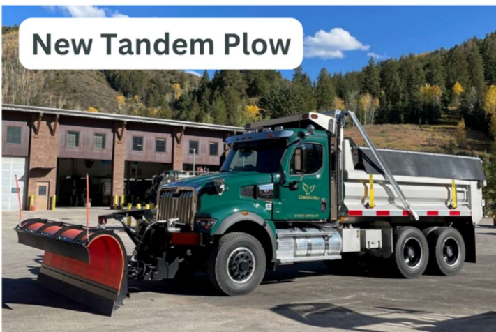
New Tandem Plow