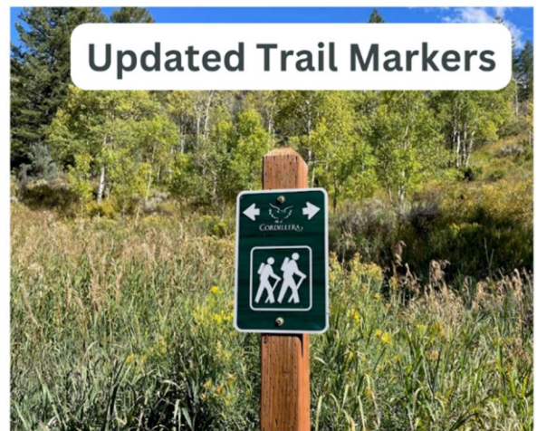
Updated Trail Markers