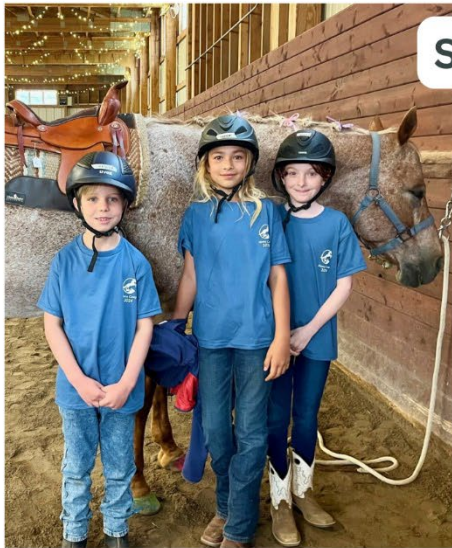
Summer Horse Camp